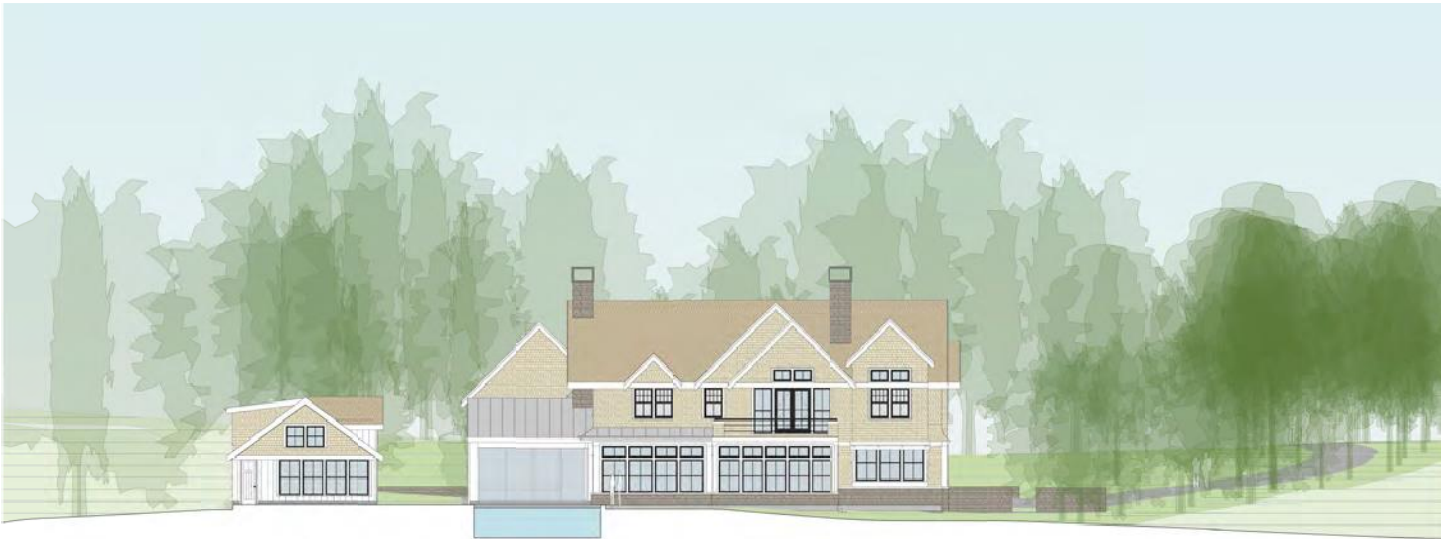
Single Family Residence Falmouth, MA